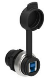
USB interface, B/A female type connection LPCD0